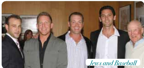
Jews and Baseball